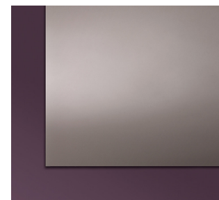
DIBOND Mirror Anthracite